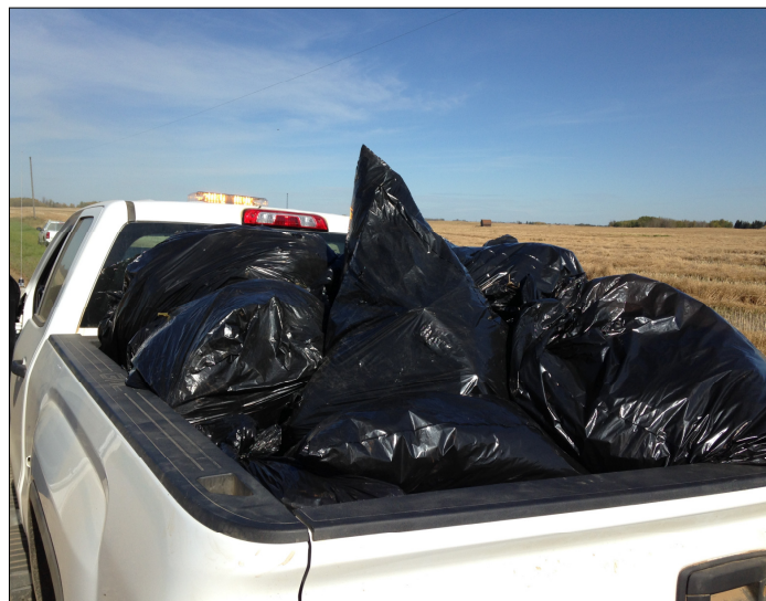
A few of the many Scentless Chamomile bags picked on a creek.

Weed control work is necessary, even on small infestations, in order to prevent them from spreading and becoming more difficult to control. We encourage you to review the weed fact sheets at www.abinvasives.ca , and consider one or more of the control options provided.