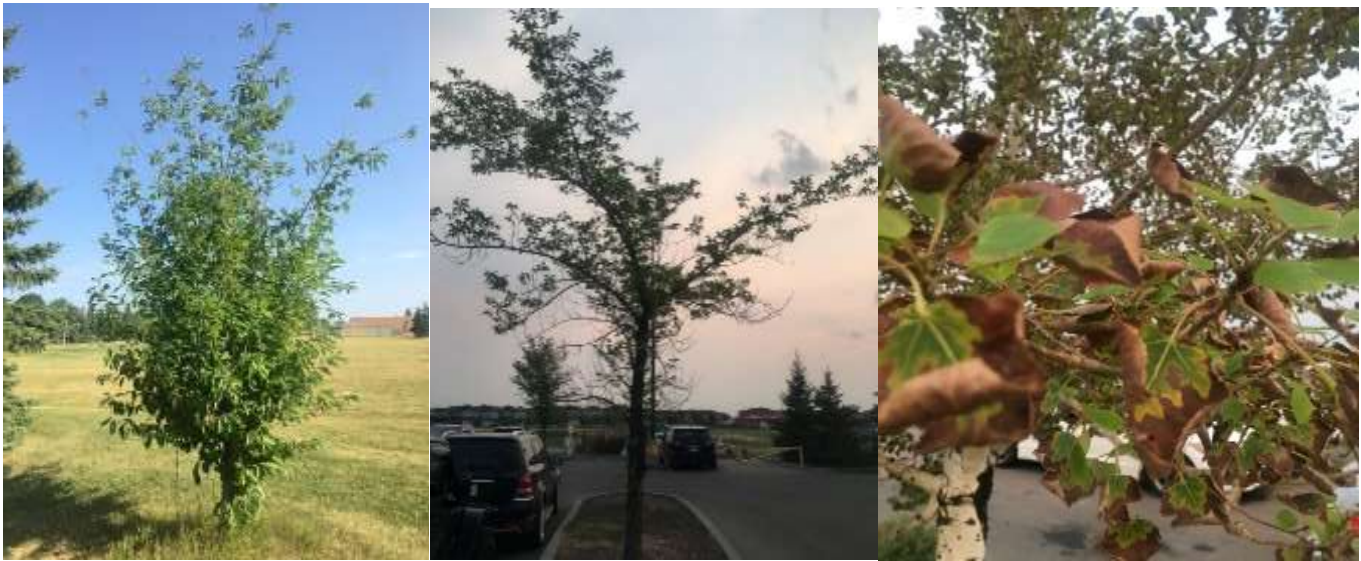
Picture 1: drought impacted trees with loss of periphery leaves ( L and C) and edge leaves browning ( R )