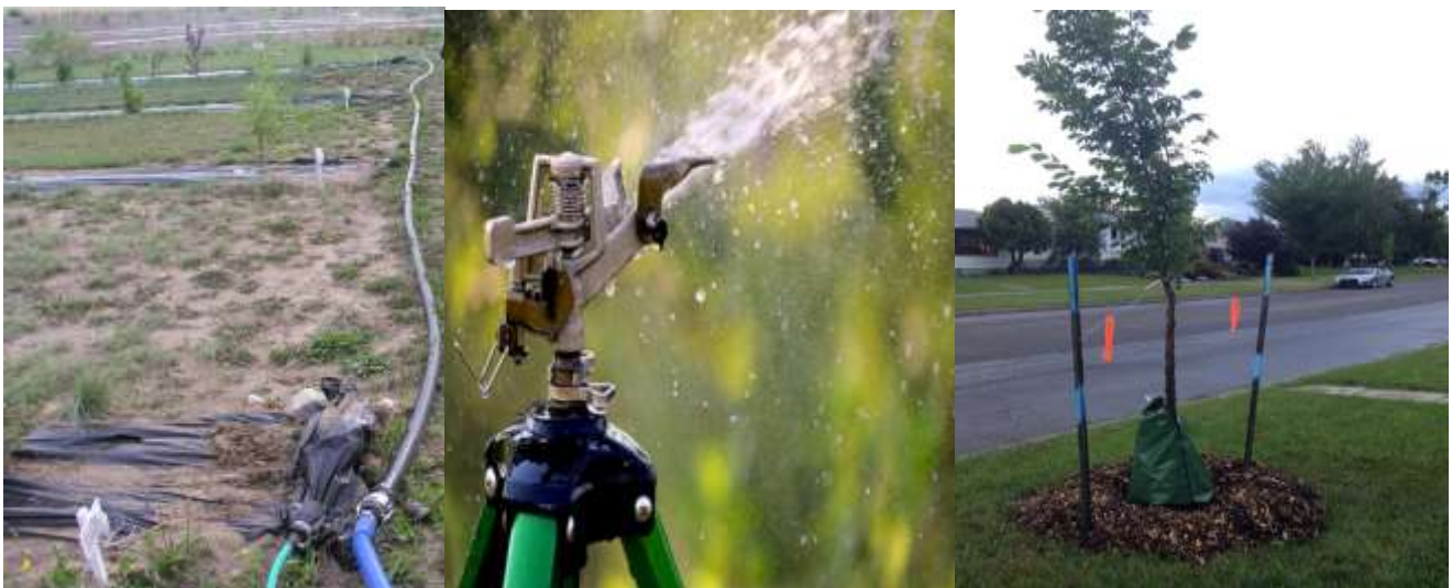
Picture 2: Watering systems – drip irrigation( L ), sprinklers( C ) and Gator bag ( R )