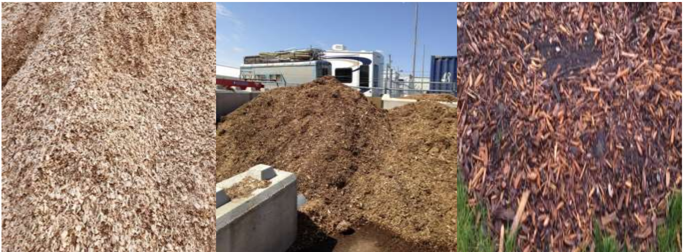
Picture 3: arborist wood chips is the best option in long term. It enhance water infiltration and retention especially during drought, moderate temperature and reduce root drought stress, and provide nutrients

Mulching is a must and the most important root protection that you can do. Mulching provides a very important function during the drought - protects roots from extreme heat and keeps moisture around trees. Create a donut-shaped wood chip cover around your tree to keep water inside. Applying 4-6 inches (10 -15 cm) of arborist wood chips mulch will greatly reduce loss of moisture in the soil. A layer of woodchips mulch will maintain more constant soil temperatures and moisture.